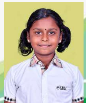
By Kanmani.J 5-A