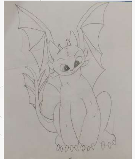
By Tanishka.P.S 5-A