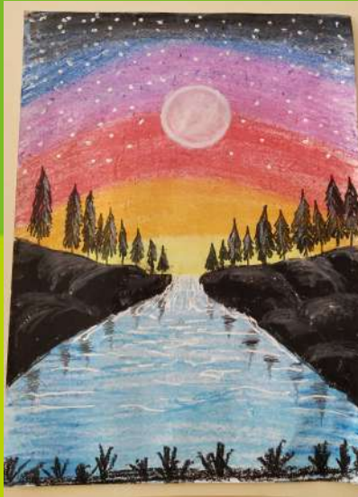
By V.Gayathri 5-A