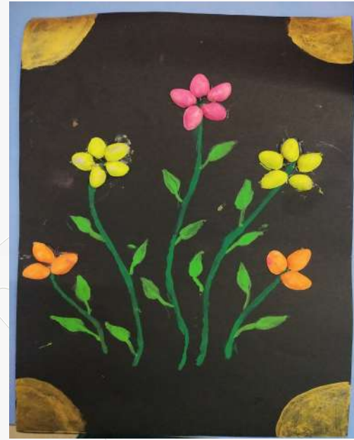
By Tanishka.P.S 5-A