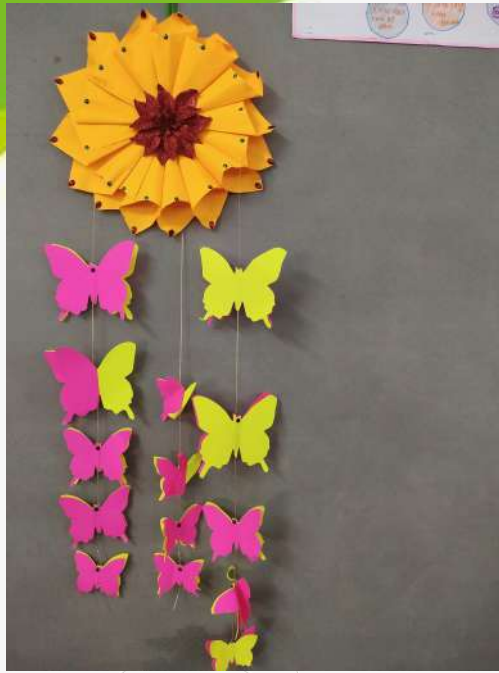
By Jaimithran.K.A 5-A