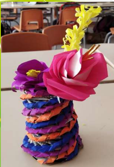
By Tanishka.P.S 5-A